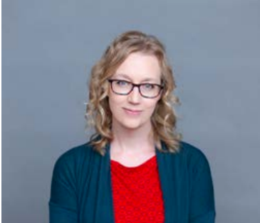
Kristin Kobes Du Mez